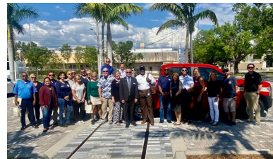
Hurricane Preparedness Trip to Ft. Myers | 2023