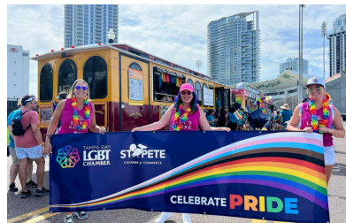
St. Pete Pride Parade | June 2023