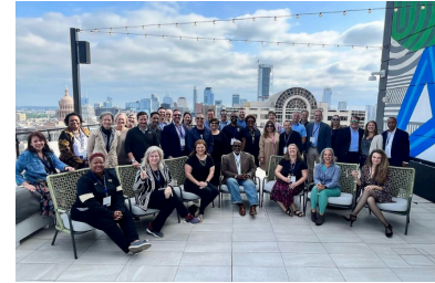
Thinking Outside the 'Burg trip to Austin, TX | April 2023