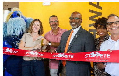
Kahwa Coffee Roasters Ribbon Cutting | 2023