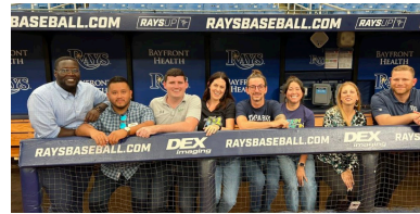
St. Pete Young Professionals Executive Board | 2023