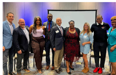
Franchising: A Path to Generational Wealth-Building for Entrepreneurs of Color Lunch & Learn | 2023