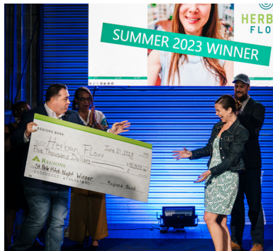
St. Pete Pitch Night | Summer 2023